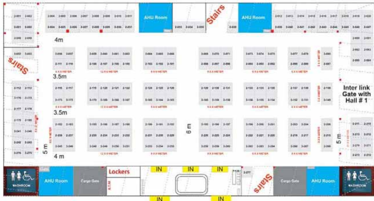
HALL # 2

Inter link Gate Ladies & Gents Wash Room AHU Room 3x3 meter Cargo Gate Exit Gate Under Mezzanine Stall