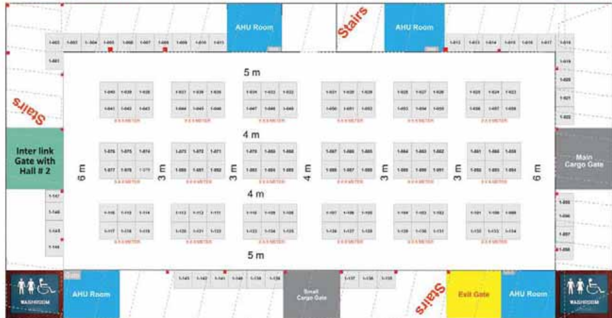
HALL # 1

Inter link Gate Ladies & Gents Wash Room AHU Room 3x3 meter Cargo Gate Exit Gate Under Mezzanine Stall